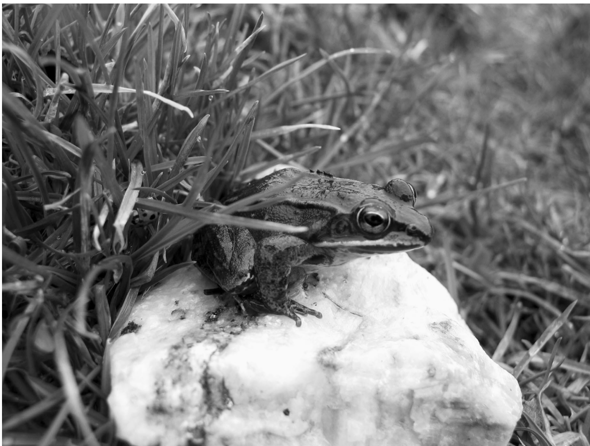
PLATE 1. An adult wood frog traveling through an agricultural field. Amphibians such as the wood frog experience high rates of death when exposed to the application of Roundup both in the aquatic larval stage and in the adult terrestrial stage.

cies in the world. To achieve a general understanding of glyphosate's impacts, we need to expand our information on amphibians both taxonomically and geographically.